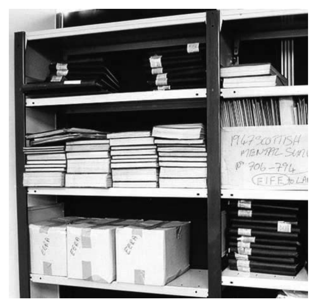
Figure 8. The ledgers that contain the original data from the Scottish Mental Surveys of 1932 and 1947. The 1932 Survey's ledgers are those to the left of the middle shelf. The 1947 Survey's ledgers are those on the left of the top shelf and the right of the bottom shelf.