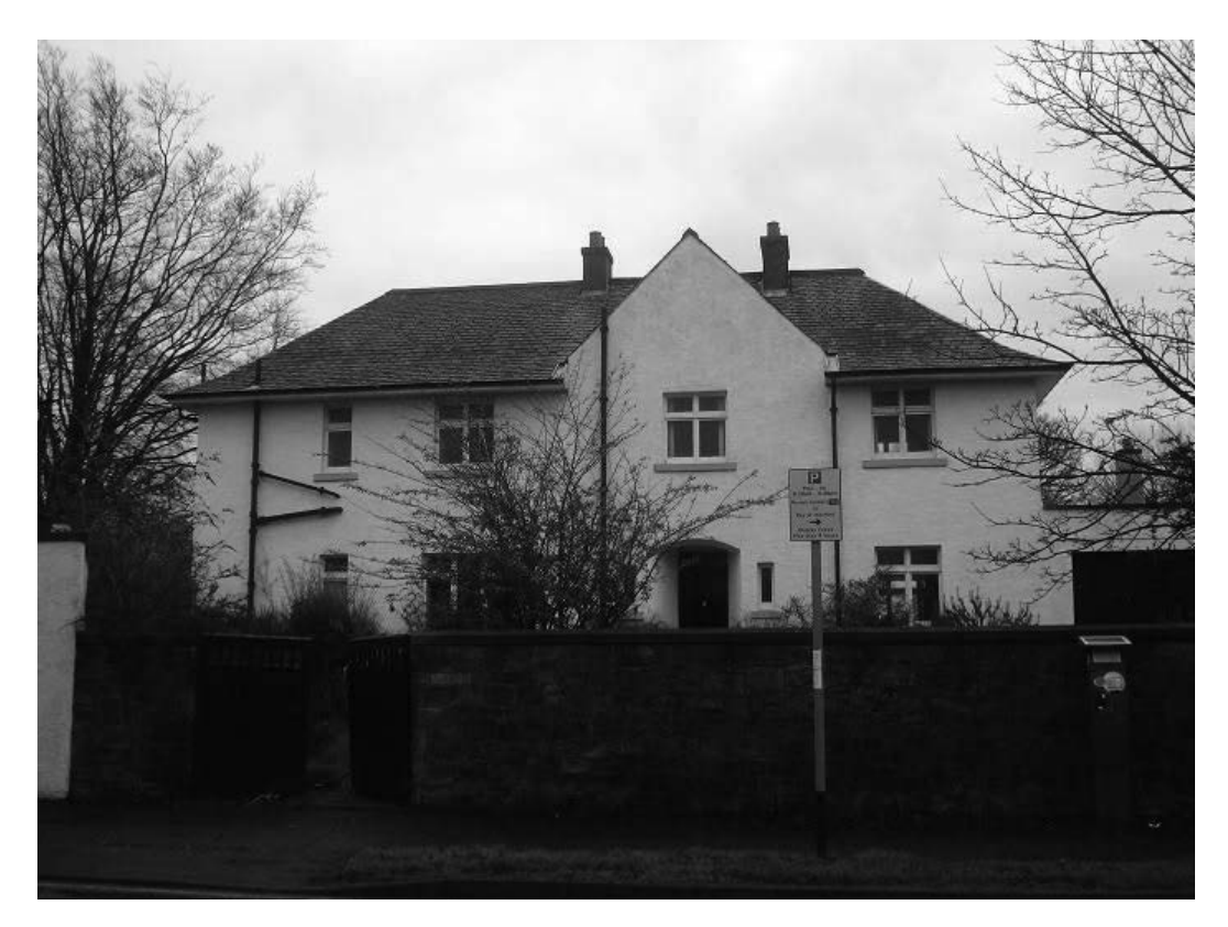
Figure 1. Godfrey Thomson's house at 5 Ravelston Dykes, Edinburgh.