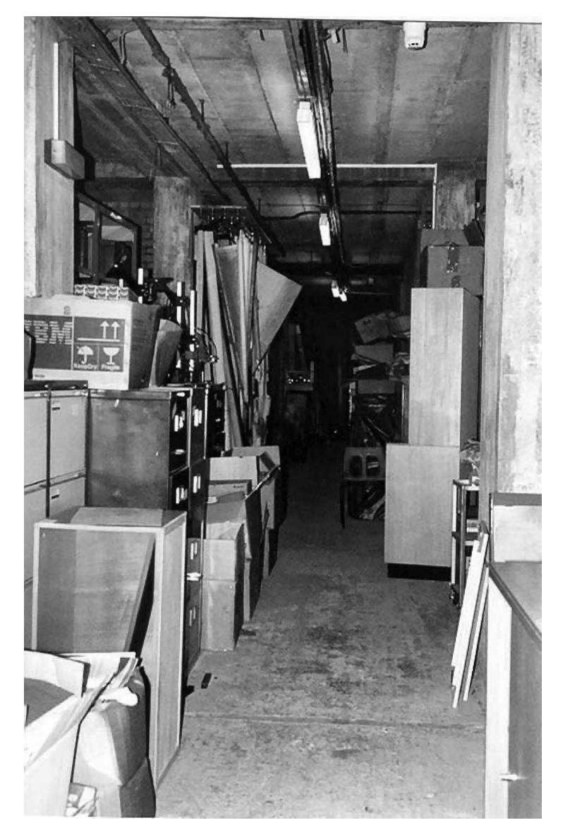
Figure 3. The basement of Charteris Land at Moray House College, University of Edinburgh in 1997. At the end of this corridor was the locked area where the Scottish Council for Research in Education had stored the data from the Scottish Mental Surveys of 1932 and 1947.

heavily involved in selection from primary to secondary school during the second quarter of the 20th century. Although he was somewhat ideologically opposed to selection based on intelligence tests, he contributed a great deal to this. His Moray House Tests, which he developed and validated and distributed, were used to test school pupils in a large number of education authorities in England. It is recorded