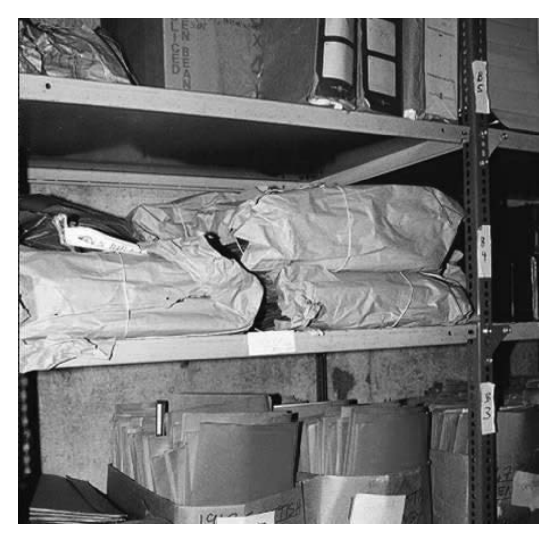
Figure 10. The folders that contain data from the individuals in the 6-Day Sample of the Scottish Mental Survey 1947. The photograph was taken in 1997 in the basement of Charteris Land at Moray House College, University of Edinburgh.