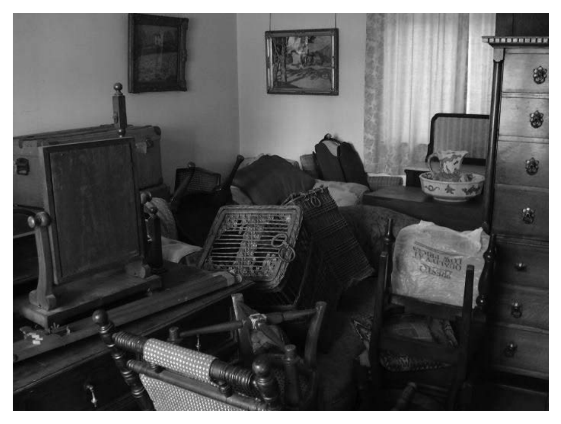
Figure 2. One of the ground floor rooms in 5 Ravelston Dykes at the time when I visited to retrieve the materials of what became the Hector Thomson Collection of Godfrey Thomson materials. Photograph copyright Ian Deary.