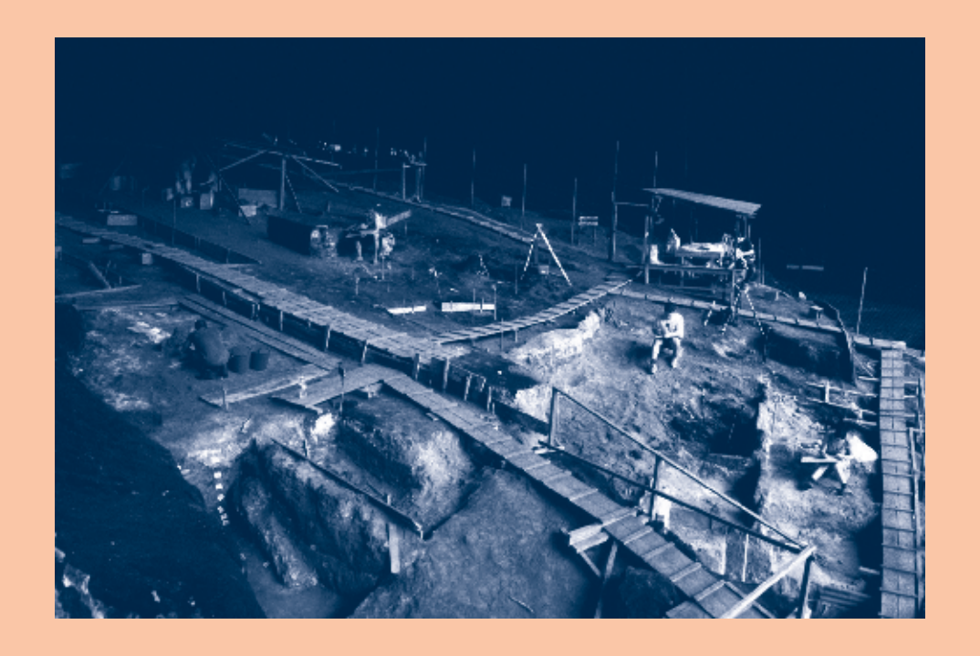
Recent excavations in Niah Great Cave (Sarawak, Borneo) at the site of previous excavations undertaken in 1950s and 1960s.