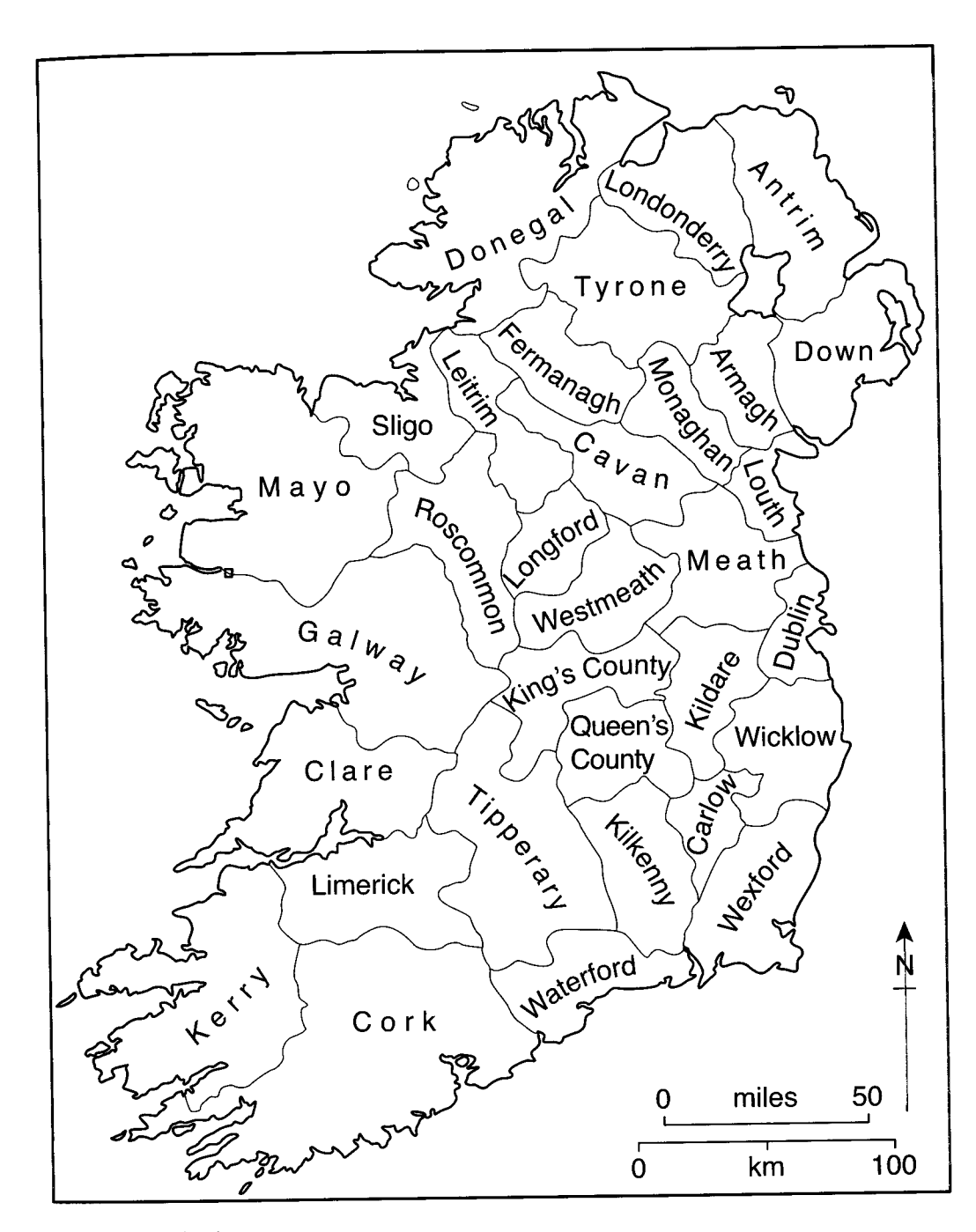
Figure 0.1. Ireland: county map.