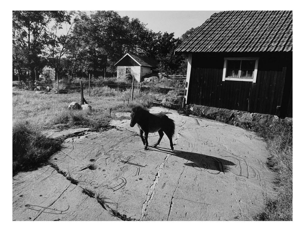
Figure 4. Rock carvings at Grillby, Uppland, well-preserved in a farmyard.

The session on the 'Presentation' of rock carving sites to the public, allied to adequate 'Protection' of the sites, proved to be the most controversial. At the outset, all are aware of the degrading effects of air pollution (principally acid rain), erosion, forestry, agriculture, motorways, industries and tourism, and doubtless other agencies, upon the rock carving sites. To many in the audience, this session was both satisfying and disturbing. Satisfying it was because it became clear that those responsible for the display of rock carvings to the public were all intensely aware of the problems and were working to devise new ways to attract a wider audience while at the same time protecting the integrity of the sites. Disturbing it was because the threats exposed by the speakers and in the long discussion that followed were seen to be many, varied and intensifying year by year. World Heritage status of the rock carvings in northern Bohuslän does not in itself help much in the physical protection of sites, although the publicity engendered by the designation is rewarding. The practical