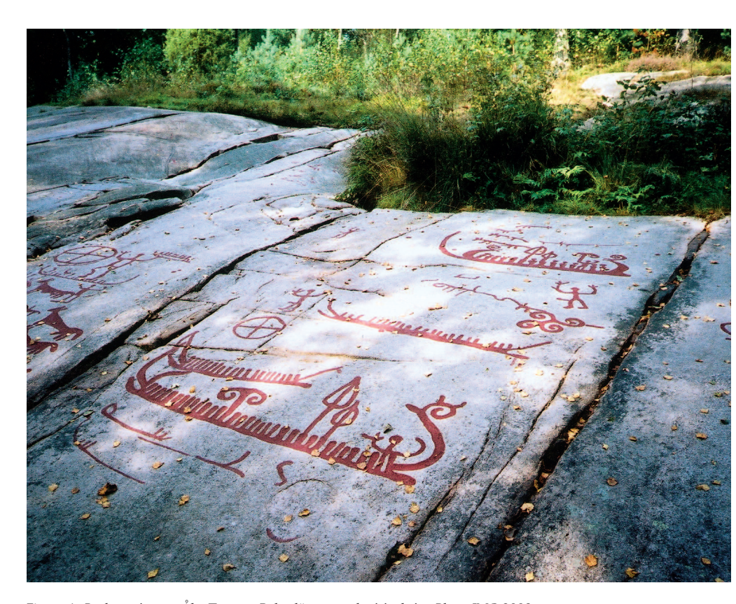
Figure 1. Rock carvings at Åby Tossene, Bohuslän, a much-visited site.

For over 150 years, antiquarians and archaeologists have struggled to record the hundreds of sites that the pioneers noted, and