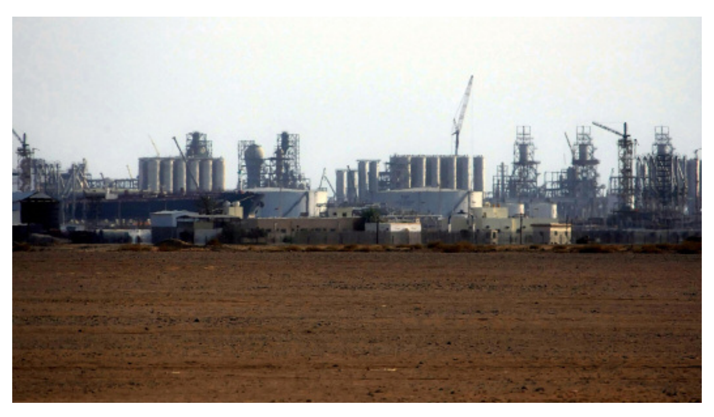
Figure 1. Rabigh Refining & Petrochemical Co. facilities, 120 km north of the Red Sea Saudi city of Jeddah, November 2007.

Since the crisis of the early 'seventies, we have taken energy for granted. It is so essential to the way we live now. Our civilisation is utterly dependent on it – light, heat, mobility depend on energy. Only recently have we moved from a long tradition of simple irritation at price rises (remember 'a pound a gallon'?) to worrying of late and at last whether there is enough energy and whether we shall get the share of it we think we need. Recently, we have even had to worry whether our use of energy is not itself existentially dangerous. Energy saving, sustainable energy, energy security are clichés which are sobering signs of the times. Climate change, carbon sequestration and alternative energy are expressions which, only a generation ago, would have meant little to most people; today they capture our anxiety.