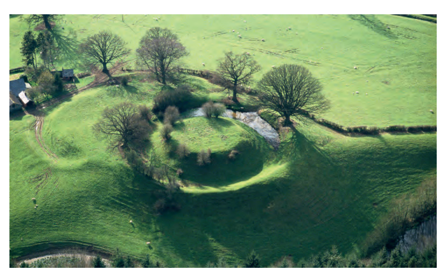
Figure 1. Owain Glyndŵr's home at Sycharth Castle, as it is today.

are depicted as crying like wild goats. Iolo Goch was no Celtophile; he had harsh words to say too about the Irish kings of Ulster and Leinster who resisted Richard II. He is, of course, reflecting what one historian has called 'a discourse of abuse' commonly aimed at the Scots from south of the border at this time. In the genealogy of Scotophobic insults, Iolo's 'wild goats' is a hybrid: it echoes such barbs as an anonymous Latin poet's gens bruta Scotiæ and Ranulph Higden's barbari satis et silvestres ('very savage and wild') and various disparaging animal metaphors, such as featuring Scots as dogs and swine (anticipating perhaps the infamous modern 'ginger rodent'). Iolo ends his poem in a crescendo of hyperbole, his patron's allegedly booty-laden service in Scotland being grimly depicted as 'A year feeding wolves', its destructive swathe being such that neither grass nor dock-leaves grew from English Berwick – as the poet significantly calls it - to Maesbury in Shropshire, a mere stone's throw from Glyndŵr's home at Sycharth.