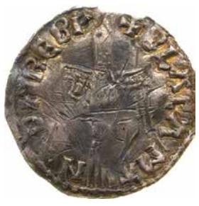
Figure 4 Agnus Dei penny of Æthelred II, from the Nesbø hoard, Norway. One of only 21 known coins of this type, struck c. 1009. (Not to scale: the coin is 19 mm across.)

however, we see Æthelred portrayed wearing a pointed helmet, a much more military look, accurately reflecting the contemporary shape of helmets, rather than following Roman inspiration as usual. With just this sole survivor, we do not know how extensive Æthelred's trial coinage with this much more active, military portrait actually was, and the coin raises important questions about how each coin type was designed and issued. Today we are used to special coin types, such as the Olympic and other commemorative 50 pence coins, which circulate alongside our normal currency. Was this coin, together with another very special coinage from c. 1009, the Agnus Dei pennies with their religious symbolism (Figure 4), intended to circulate alongside the main coin type, to deliver twin messages of military intent and Christian intercession, in the face of Viking attacks? Or is this simply an experiment or sample, never issued widely, possibly because Æthelred decided he disliked the message sent by the helmet? The Slethei coin shows that, even in the much-studied Anglo-Saxon coinage, fascinating questions remain to be answered about kings and the currency.