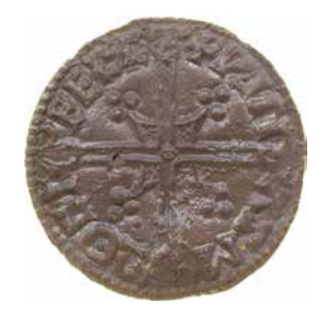
a. A coin of Æthelred's Helmet type, struck c. 1004-9 at Ilchester; theshape and ornamentation of the helmet is inspired by Roman coins.