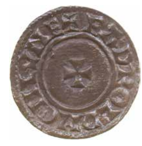
b. A coin of Æthelred's Last Small Cross type, struck c. 1009-16 at London. (SCBI 65, nos. 927 and 1347. Not to scale: the coins are 18 mm across.)