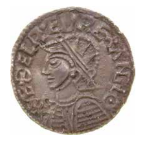
Figure 3 Two coins of Æthelred II from the Slethei hoard.