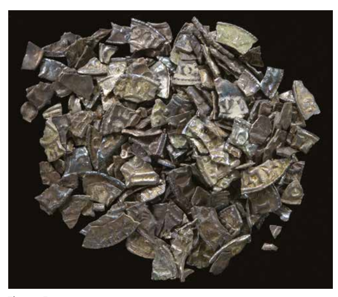
Figure 5 Fragments from the Årstad hoard, ranging in size from 1 mm to 10 mm across. The Slethei fragments are very similar, though on the whole towards the smaller end of the scale!

Researching the individual finds and museum collections of coins also opened unexpected doors on the history of 19th-century Norway. This was the formative period in which most of Norway's museums were founded (or further developed, in the case of the collections of the Trondheim-based Royal Norwegian Society of Sciences and Letters, established in 1760). The enormous interest in Norway's Viking and medieval past, stimulated by Norway's new status as a nation, was an important impetus in these developments. Nineteenth-century Norway was also fortunate in having a succession of eminent scholars who researched and published the hoards discovered in that century, whether academics such as Professor Christian Andreas Holmboe (linguist and keeper of Oslo University's Coin Cabinet), or collectors and scholars such as Schive. While their international counterparts tended to a pragmatic approach, and often melted down unwanted coins to purchase more interesting specimens, it is striking that the Norwegian museums