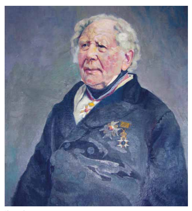
Figure 1 Claudius Jacob Schive. The portrait was painted for the Oslo University Coin Cabinet in the 1920s, and hangs today in the Museum of Cultural History, Oslo.

I first encountered the Slethei hoard and Claudius Jacob Schive in 2004-5, when I started to catalogue all the Anglo-Saxon and later British coins in Norway up to 1272 for the longstanding British Academy publication series, the Sylloge of Coins of the British Isles ('sylloge' in this context means an illustrated catalogue). I visited museums in Oslo, Trondheim, Bergen and Stavanger to catalogue and photograph all the British and Anglo-Saxon coins in their collections, and research all the individual hoards, finds and donations that had built up each collection. Chronologically, the coins range from