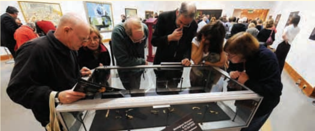
The Staffordshire Hoard on display in Birmingham Museum and Art Gallery, November 2009

Over the last decade, the pivotal economic importance of the creative, cultural and media industries – and the role that arts, humanities and social research plays in fuelling and sustaining them – has been recognised by the European Commission, the World Bank, and national and local governments. Their importance is likely to increase as changing social trends result in heightened demand for leisure activities.