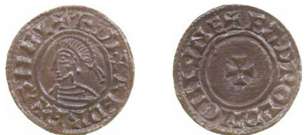
b. A coin of Æthelred's Last Small Cross type, struck c. 1009-16 at London. (SCBI 65, nos. 927 and 1347. Not to scale: the coins are 18 mm across.)