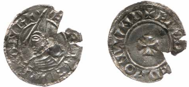
Figure 2 The unique coin of Æthelred II found in the Slethei hoard, portraying the king in a pointed helmet. It is accompanied by C.I. Schive's original coin ticket describing the 'tall pointed helmet' and concluding that this is a 'new type'. (Not to scale: the coin is 18 mm across.)