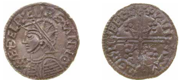
a. A coin of Æthelred's Helmet type, struck c. 1004-9 at Ilchester; the shape and ornamentation of the helmet is inspired by Roman coins.