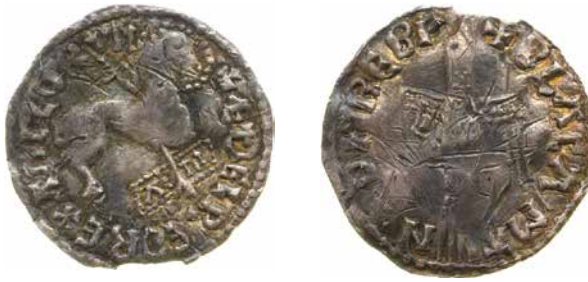
Figure 4 Agnus Dei penny of Æthelred II, from the Nesbø hoard, Norway. One of only 21 known coins of this type, struck c. 1009. (Not to scale: the coin is 19 mm across.)

however, we see Æthelred portrayed wearing a pointed helmet, a much more military look, accurately reflecting the contemporary shape of helmets, rather than following Roman inspiration as usual. With just this sole survivor, we do not know how extensive Æthelred's trial coinage with this much more active, military portrait actually was, and the coin raises important questions about how each coin type was designed and issued. Today we are used to special coin types, such as the Olympic and other commemorative 50 pence coins, which circulate alongside our normal currency. Was this coin, together with another very special coinage from c. 1009, the Agnus Dei pennies with their religious symbolism (Figure 4), intended to circulate alongside the main coin type, to deliver twin messages of military intent and Christian intercession, in the face of Viking attacks? Or is this simply an experiment or sample, never issued widely, possibly because Æthelred decided he disliked the message sent by the helmet? The Slethei coin shows that, even in the much-studied Anglo-Saxon coinage, fascinating questions remain to be answered about kings and the currency.