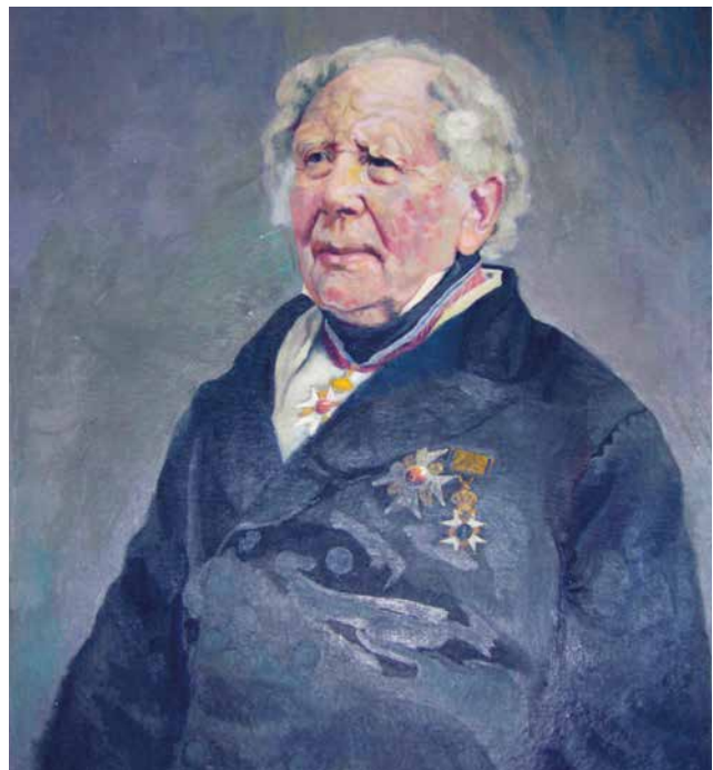
Figure 1 Claudius Jacob Schive. The portrait was painted for the Oslo University Coin Cabinet in the 1920s, and hangs today in the Museum of Cultural History, Oslo.

I first encountered the Slethei hoard and Claudius Jacob Schive in 2004-5, when I started to catalogue all the Anglo-Saxon and later British coins in Norway up to 1272 for the longstanding British Academy publication series, the Sylloge of Coins of the British Isles ('sylloge' in this context means an illustrated catalogue). I visited museums in Oslo, Trondheim, Bergen and Stavanger to catalogue and photograph all the British and Anglo-Saxon coins in their collections, and research all the individual hoards, finds and donations that had built up each collection. Chronologically, the coins range from