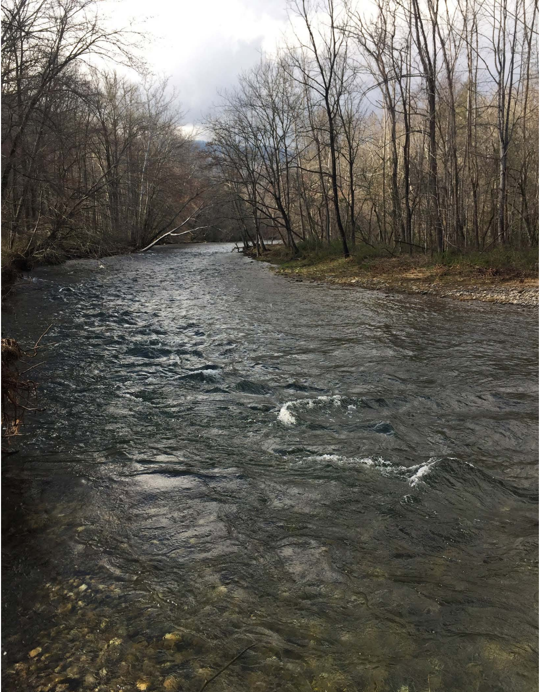
Figure 2. The Oconaluftee River begins life high in the Appalachians at Newfound Gap near the Tennessee-North Carolina border. It flows westward and eventually connects with the Tuckasegee River. The cool, shallow waters of the 'Luftee' flow through the centre of the Qualla Boundary, home to the Eastern Band of Cherokee Indians.