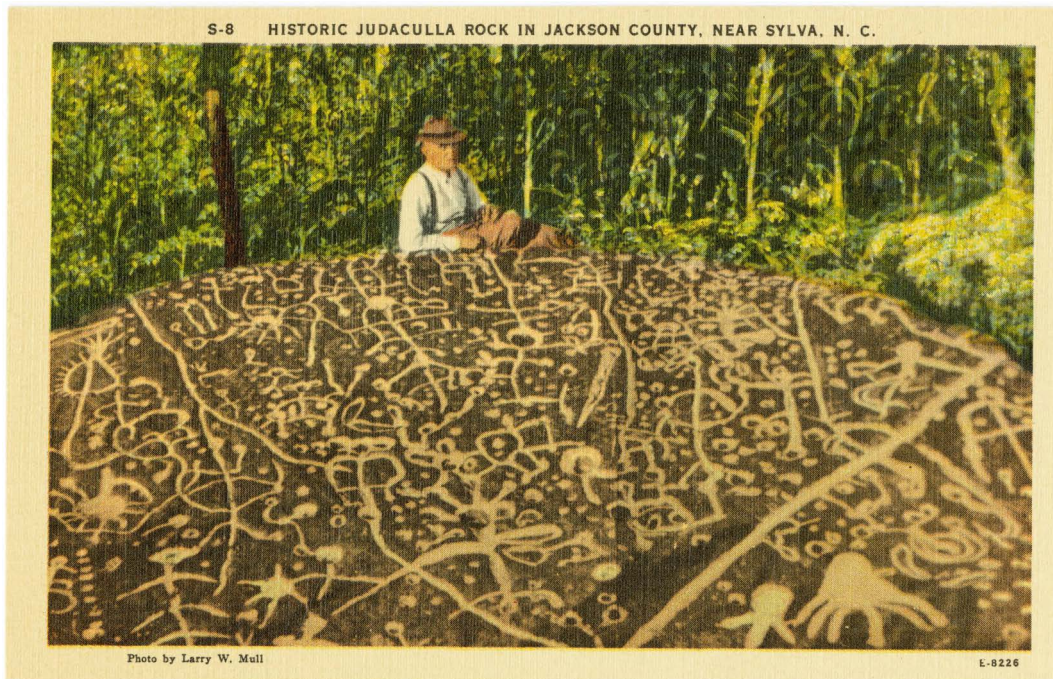
Figure 3. Historic postcard of Judaculla (or Tsul Kalu ) Rock. Author's collection.

This deep history of major environmental changes and geological formations is today embedded in rock, sediment, and soil. Some of it now lies under roads, cities,