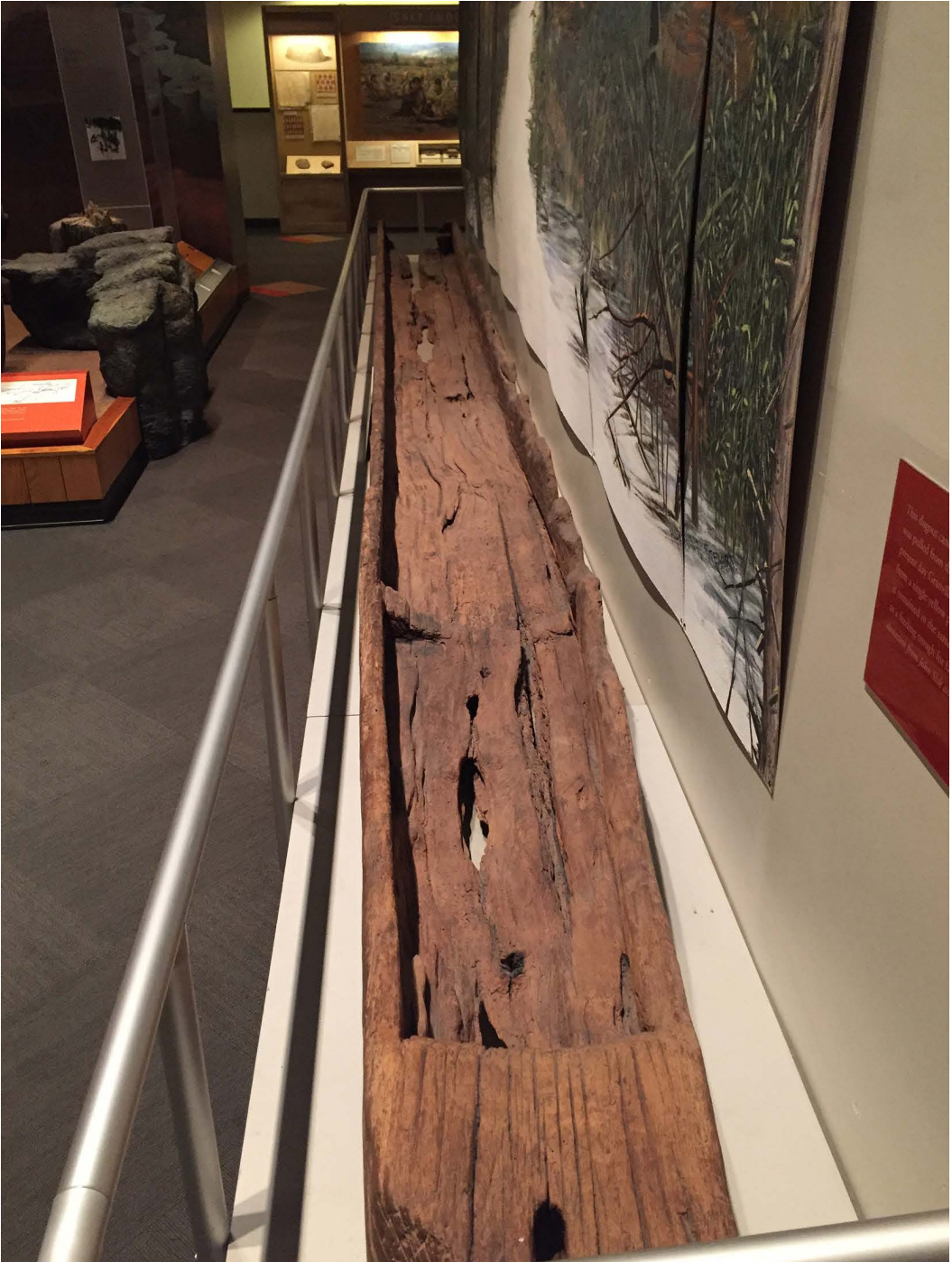
Figure 4. A rare archaeological find, a canoe unearthed in Cherokee country and housed at the Tennessee Division of Archaeology, Nashville, Tennessee.