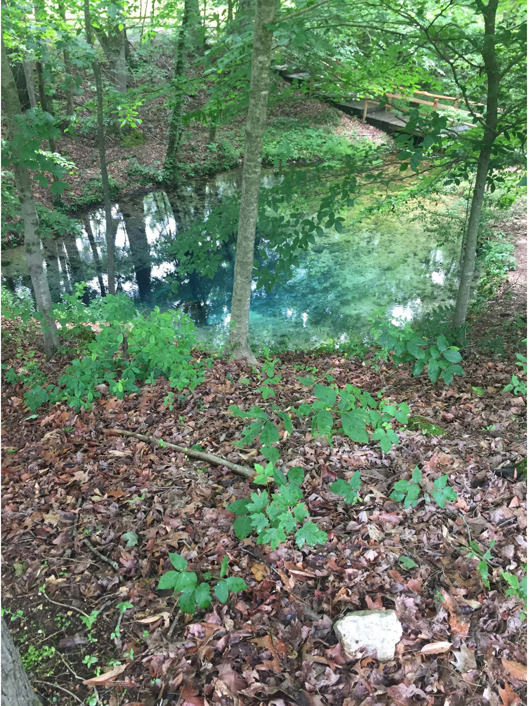
Figure 5. Blue Hole Spring, a gateway to the Underworld.