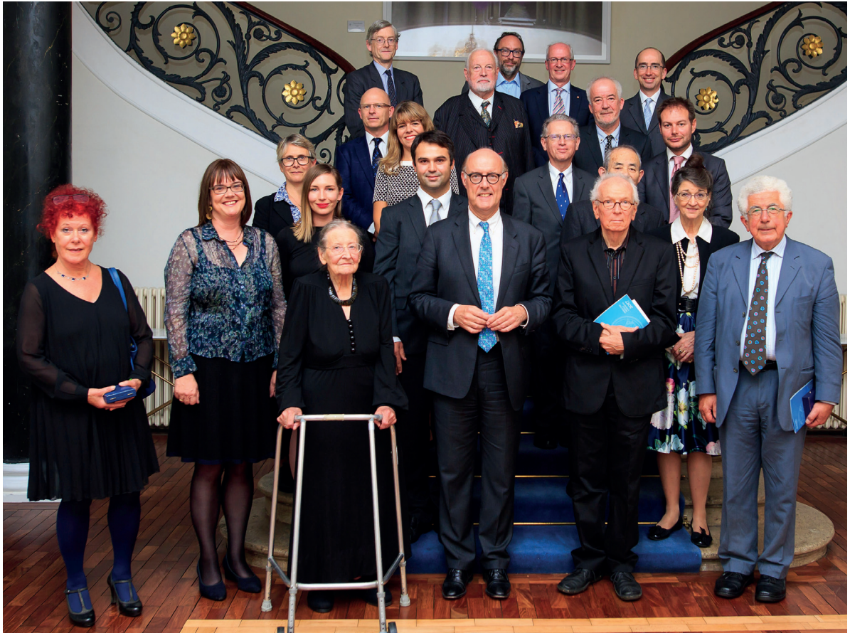
The British Academy's Prizes and Medals Ceremony was held on 27 September 2017. A full list of the winners can be found via www.britishacademy.ac.uk/prizes