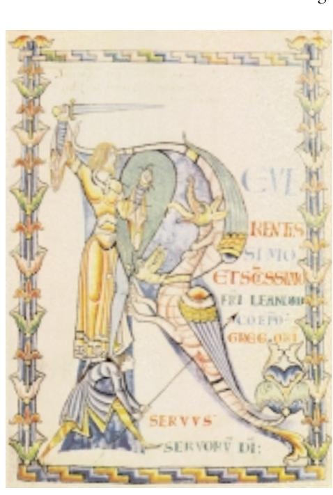
This example of a historiated initial R from the frontispiece of a 12th-century manuscript of St. Gregory's Moralia in Job closely resembles the dragon fight of Beowulf and Wiglaf.

Even at this early point in the poem we have learned that a momentary period of happiness and calm is likely to be followed by a reversal: and on cue, as it were, the monster comes, gliding through the night like a shadow, and bursts into the hall. Beowulf confronts him and tears off his arm and shoulder, inflicting thereby a mortal wound.