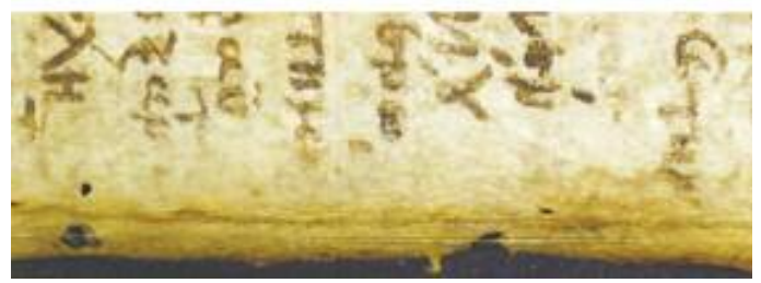
Top: A pseudo-colour image of the Hyperides text in the Palimpsest. Note this text is written in one column, while the Archimedes text is in two. The lower image shows detail of the third unique text in the manuscript in natural light