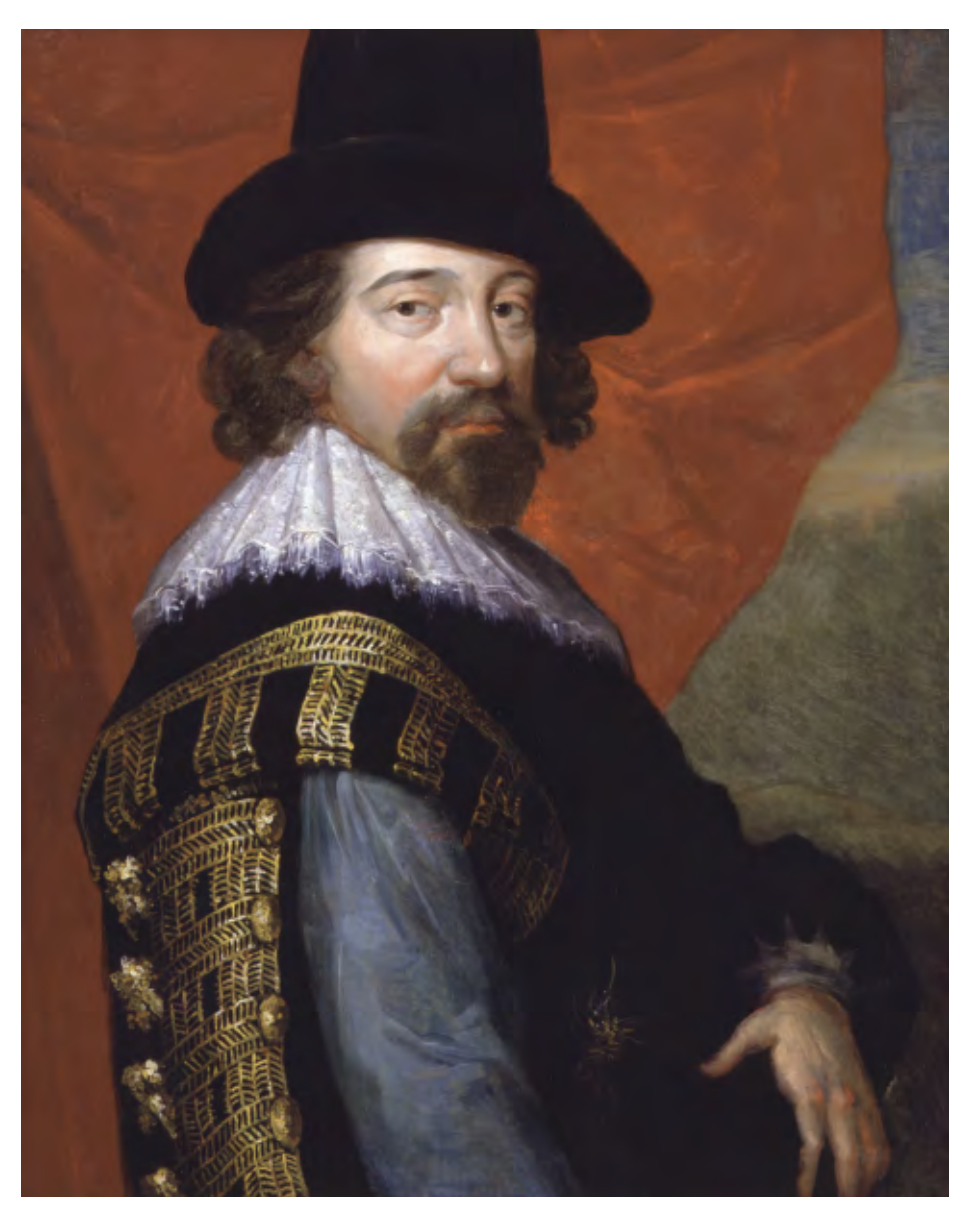
Figure 1: Francis Bacon by John Vanderbank after an unknown artist (National Portrait Gallery, London).

and its relation to Bacon's literary career and ideas current in his day. Above all, we might look closely for meanings afforded by study of the materiality of the manuscripts or printed books which bear the texts. This study is often not given its due weight by scholars, even though it can fundamentally change not just the ways in which we