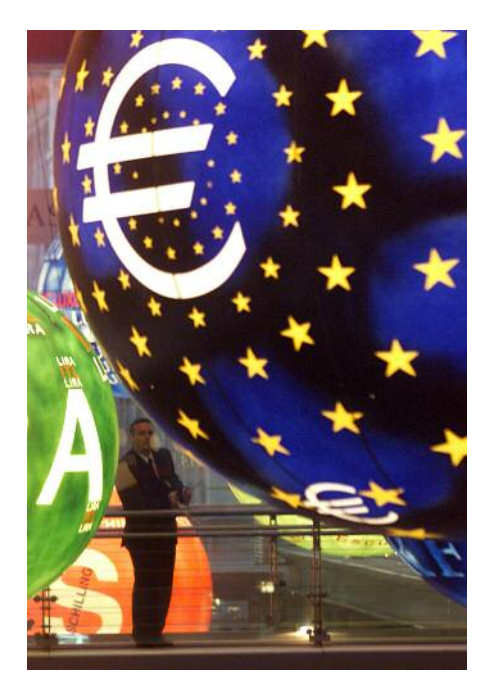
Figure 2. Preparations in Paris for the launch of the euro in January 1999. Both Britain and Denmark have an opt-out from the euro, but Denmark is in the Exchange Rate Mechanism (ERM II). Recent members of the European Union

However, the auditing of differentiated integration in the workshop showed that EU member states had been reluctant to invoke the Amsterdam and Nice treaty provisions. The widening scale and variety of forms of differentiated integration placed in question the two traditional premises. In many new policy sectors, the distribution of gains and costs from integration were asymmetrical in ways that made it rational for some states to prefer non-commitment.