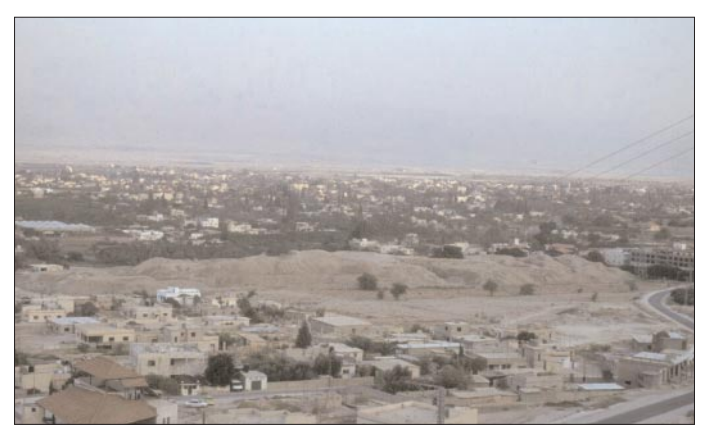
Figure 2. Tell-el Sultan, Jericho, in September 1999.