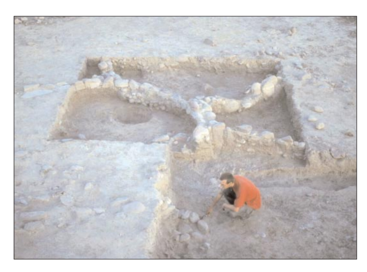
Figure 4. Excavation of circular dwellings at WF16, September 2000.

a PPNA site as gazelle is normally the dominant fauna. It may be explained by the relatively rocky surroundings of WF16, as the land to its immediate east begins to climb towards the Jordanian plateau. The capra bones are also surprisingly small; in fact, as far as we can ascertain, they are no different in size to those at the later PPNB settlements of Ghuwayr 1 (figure 5), located just 500 m away, and Beidha, which is 50 kilometres to the south-east. Animal size is a strong indication of wild/domesticated status and there is no doubt that the goat bones from Ghuwayr 1 and Beidha came from domestic herds. It is also characteristic of herding economies to slaughter a majority of the immature individuals, whereas hunters tend to select the larger mature animals to kill. The bones from WF16 are equally divided between mature and immature animals. So, if they are indeed from goat, did they come from animals living in domesticated herds or wild flocks? The evidence suggests the former, or at least herds over which there was some form of human control even if the animals remained partially wild. If this is the case, then the WF16 goats would be some of the earliest known animals under human control in the Near East.