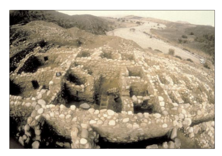
Figure 5. Ghuwayr 1, (PPNB), Jordan. The site of WF16 is located on the small spur visible in the background of the picture

The animal bones from WF16 are dominated by those of capra , most likely of wild goat but possibly of ibex. This is unusual for