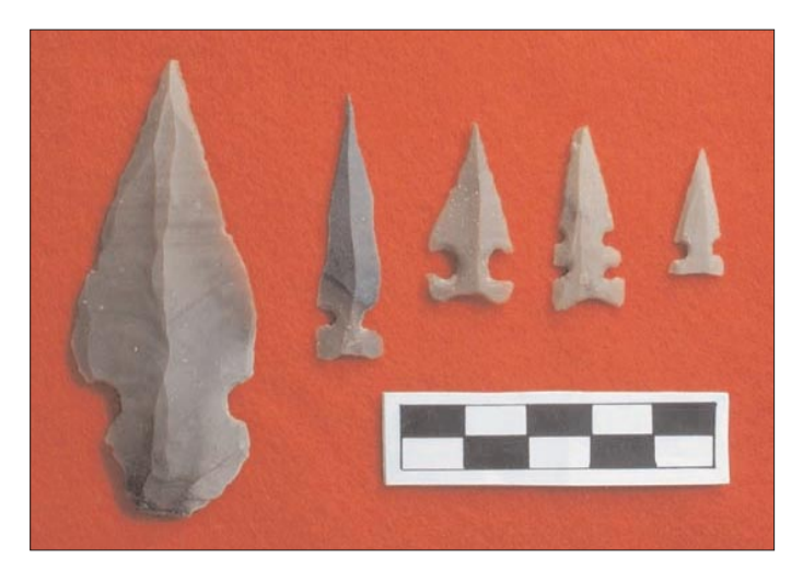
Figure 6. El Khiam points, a disgnostic artefact of the PPNA.

A reduced emphasis on hunting activity is also apparent from the patterns of breakage, damage and wear identified on the pointed stone artefacts from WF16 by microscopic examination. A characteristic tool of the PPNA is the el-Khiam point. These are triangular in shape with opposed notches at their base ( figure 6 ).