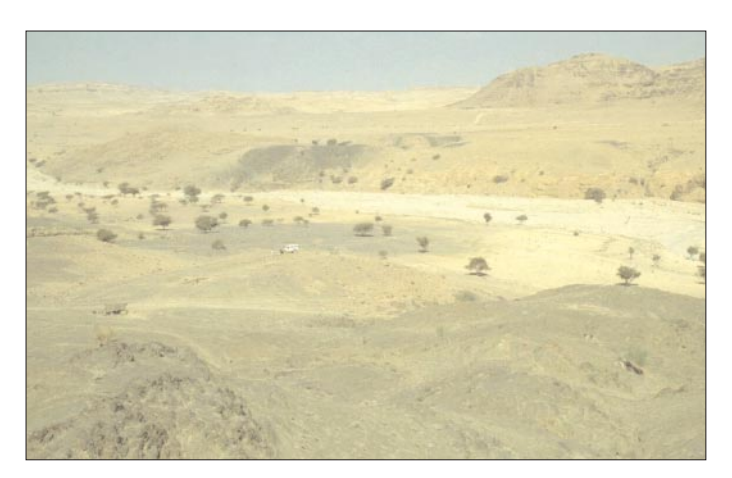
Figure 3. Wadi Faynan, Jordan, in September 2000. The land rover is positioned on the PPNA site of WF16.

During the last few years, however, both the pre-eminence of Jericho and environmental change as the prime, perhaps only, cause of economic change have become increasingly questioned. New archaeological discoveries have shown that the PPNA was more widespread than previously believed, while the true significance of Neolithic ideology – the religious views and practices of this period – is becoming appreciated.