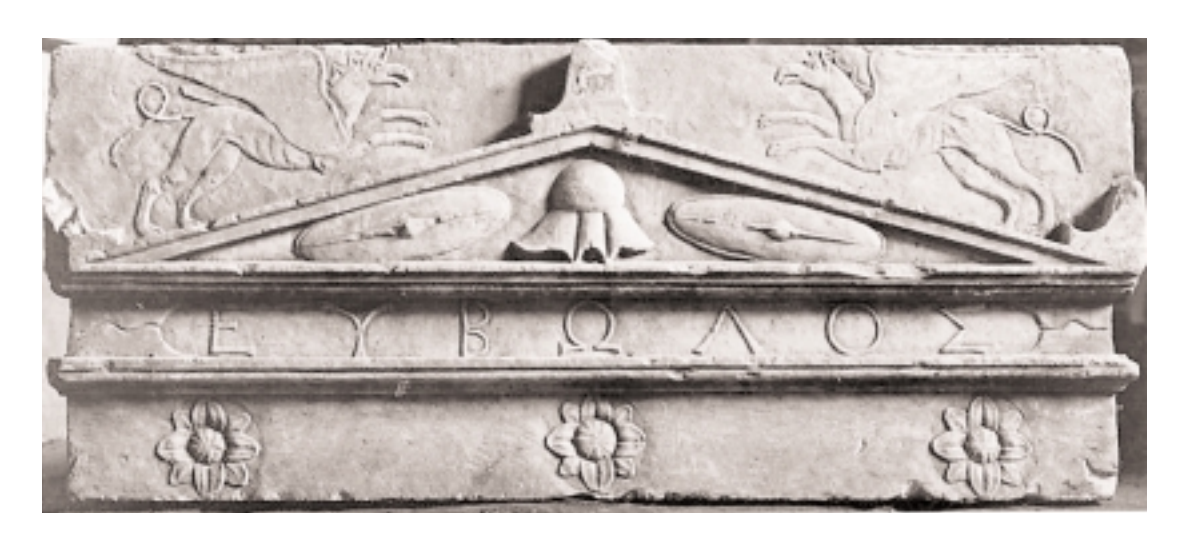
Figure 4. Tombstone of a military man, showing distinctively Boeotian helmet, shield and griffin decoration. His name, Eubolos, Boeotian dialect for Euboulos, is inscribed in very fine relief lettering in a sunken field, a style characteristic of the region. Tanagra, Boeotia, third century BC.

developments arising from them. Fundamental to the ability to respond to new enquiries and proposals are the electronic resources. The project began using computers in 1975, a primitive period of card punching and improvised ways of coping with the absence not only of Greek fonts but even of lower-case letters. Fortunately, in 1984, we paused to take stock and, drawing the benefit of the ten years' research already accomplished, reconsidered the research values and inter-relations of the various components of the data we had collected. The resulting database schema has stood us in good stead, accommodating the academic demands of very varied material and migrating successfully through two database and typesetting systems, and now supporting the delivery of data online.