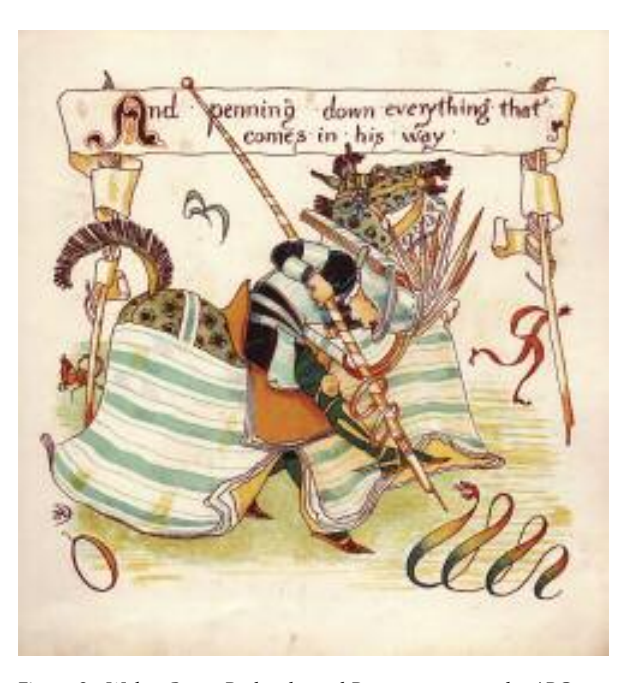
Figure 2. Walter Crane, Pothooks and Perseverance: or the ABC-Serpent (London: Marcus Ward & Co Ltd, 1886), [np]

sense of educational and political purpose, linking the imaginary world of Crane's illustrations with the visionary world of his politics, and it is those associations – between art and language, childhood, and social reform – that I shall explore here.