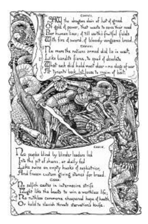
Figure 5. Walter Crane, The Sirens Three, A Poem (London: Macmillan & Co., 1886), [np., stanzas cxxvii–cxxix)

believed that society could evolve toward a better, fairer balance of wealth and labour, and toward a renaissance of the applied arts. He also believed that it would evolve away from its dependence on an arid combination of naturalistic painting and visually illiterate text toward a situation where people communicated primarily through pictorial symbols. This prediction built on a model of human development as a spiralling cycle, using an analogy between the growth of the individual and racial development which circulated among Crane's contemporaries. What is interesting in Crane's case is that he applied the model to visual communication. According to his world-view, evolution was spiralling round again to the pre-industrial, pre-textual days of the symbolic word-picture - the sort of pristine, visual eloquence demonstrated by his children's books.6