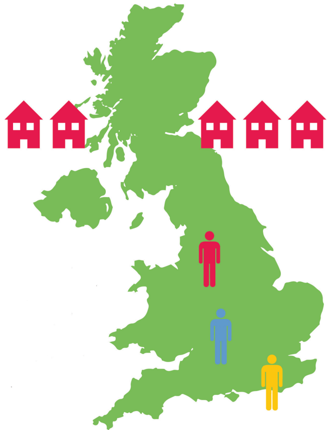
Further information about Understanding Society , the UK Household Longitudinal Study, can be found via www.understandingsociety.ac.uk

Understanding Society forms part of an international network of household panel studies. The household panel design was established in the Panel Study of Income Dynamics (PSID) in the USA in the late 1960s, and now also includes the German Socio-Economic Panel Study, the Household, Income, and Labour Dynamics in Australia Survey, the Swiss Household Panel and other active household panels in South Africa, Israel, Canada, Korea, China. This design has proved extremely powerful in understanding changes in populations and the determinants of behaviour and outcomes at household and individual level. International comparisons across