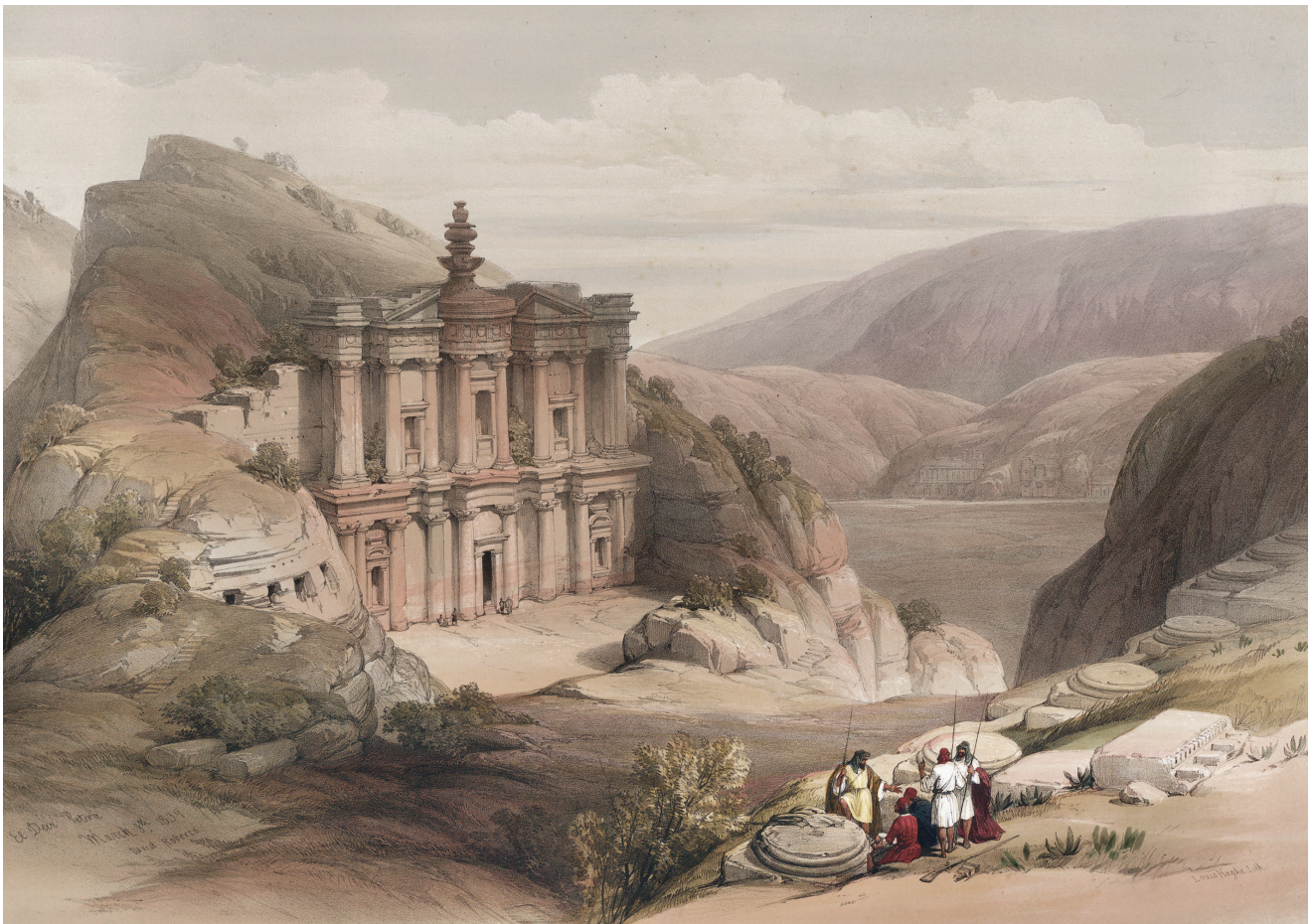
Figure 1 The Bedouin appear prominently in this 1839 painting of El Deir, Petra, by David Roberts.