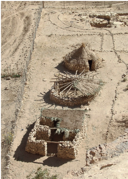
Figure 3b Beidha: experimental reconstruction of Neolithic buildings.