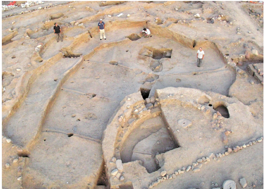
Figure 4 Wadi Faynan 16, one of the world's first large public buildings, built about 11,600 years ago, with tiered benches around a central space.

Anthropological research affiliated to CBRL has also examined the local Bedouin populations in light of the UNESCO proclamation of Bedouin ‘Intangible Cultural Heritage’, where an existing knowledge of the economic