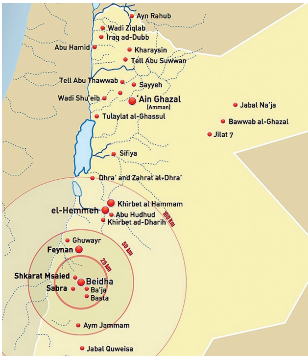
Figure 2 Distribution of Neolithic sites in Jordan.

landscape, and ecotourism is relatively well marketed. These tourists stay almost twice as long as the tour company visitors, and are less sensitive to security problems, which is critical to sustainable tourism. Small numbers of tourists spending money in the right places and behaving in an appropriate way can make a large positive contribution to small communities. They seem an ideal market to target to develop the ideas of Neolithic heritage tourism.