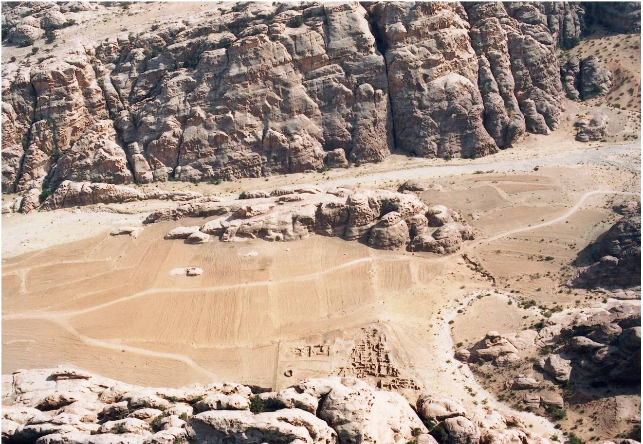
Figure 3a Beidha: aerial view.