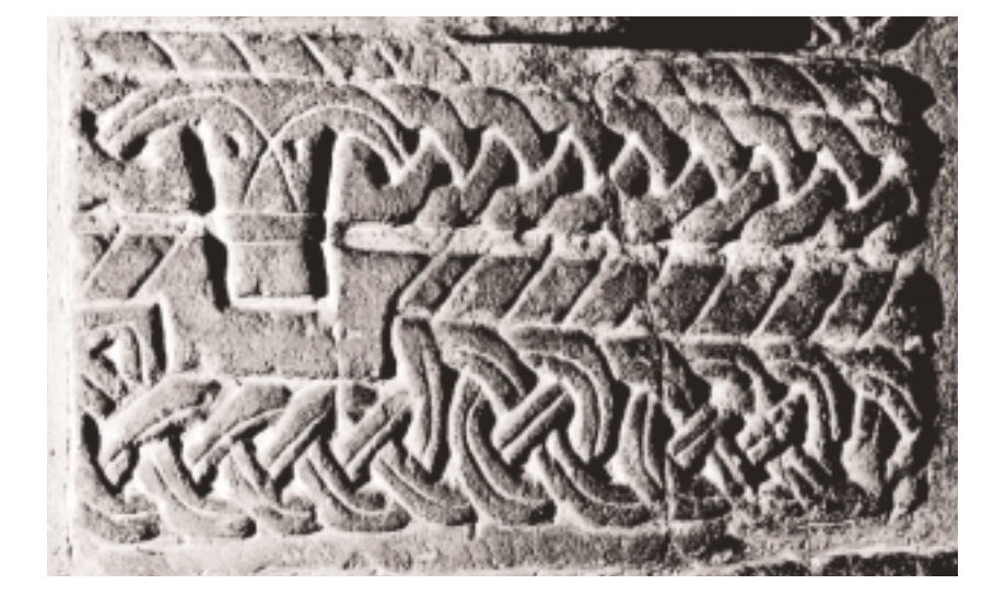
Part of a grave-cover from Burton Pedwardine, Lincolnshire, with bull's head motif

The Corpus of Anglo-Saxon Stone Sculpture was established as an Academy Research Project in 1972. Its aims are to publish fully-illustrated catalogues of Anglo-Saxon carved stones, with discussions of their context and significance. The series is published by the Academy. Further details of the work of the Committee and the volumes published by the Academy may be found via www.britac.ac.uk/arp