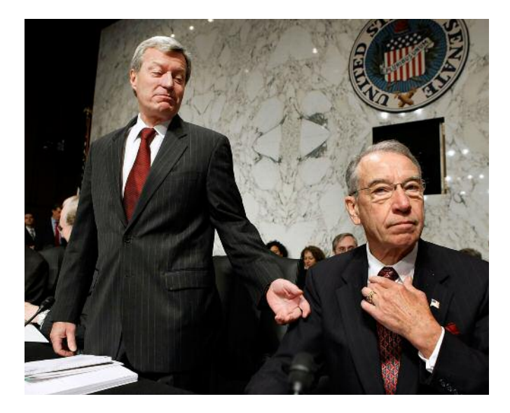
Figure 1. Senate Finance Committee Chairman Max Baucus talks with ranking member Senator Charles Grassley (right), ahead of the committee's vote on the health care reform legislation, 13 October 2009, Washington, DC.

I would guess that none of you have any clear idea of what it is that President Obama is in favour of when he proposes an 'overhaul of