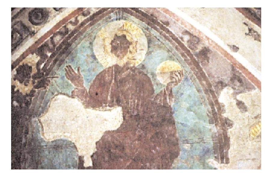
Figure 3. Christ, detail of the Transfiguration mural