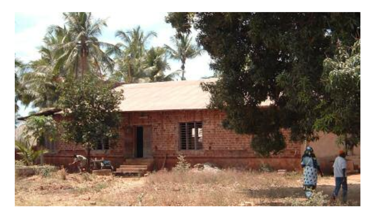
Figure 1: The mosque in the country town of Rwangwa, founded in 1947 and at the centre of a recent controversy between mainstream Muslims and Ansar reformists.

performance was no more religious than pop music. Moreover, the band was widely known to be sponsored by the government. The designation as 'Tanzania One Theatre' therefore also ridiculed the Sufis' deference to government and the determination of mosque elders to translate religious authority into a right to be heard by officials.