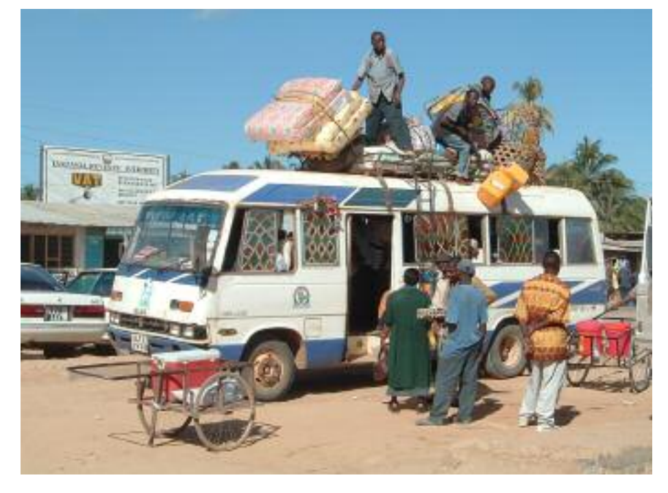
Figure 2: Young people's precarious economic ventures at work: selling eggs and water, and loading the 'Ng'itu Express', the bus that was the only form of public transport to Rwangwa.

The conjunction of political and generational conflict was evident in the Ansar's attacks. While a handful of men of middle age or above provided them with financial and ideological support, the people who vocally proposed and defended their views were overwhelmingly young. As they saw it, they were taking on a Muslim establishment