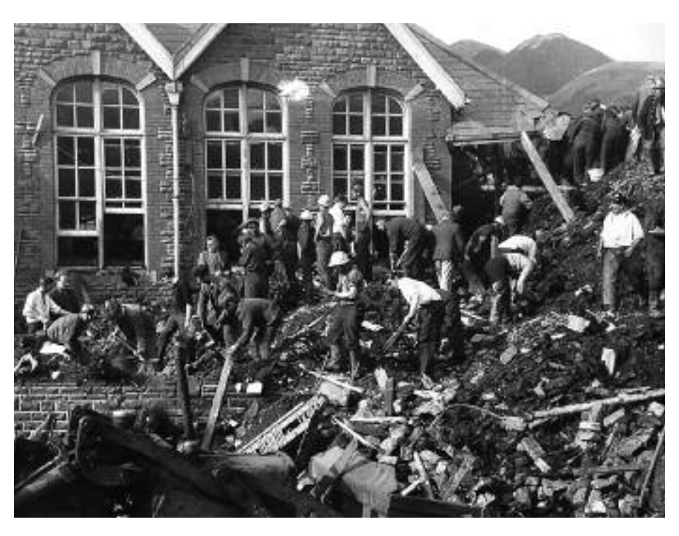
Figure 2: Rescue workers digging outside Pantglas Junior School, in which 109 children and five teachers died.

For the National Coal Board, through its counsel, thus to invite the Tribunal to ignore the evidence given by its Chairman was, at one and the same time, both remarkable and, in the circumstances, understandable. Nevertheless, the invitation is one which we think it right to accept.