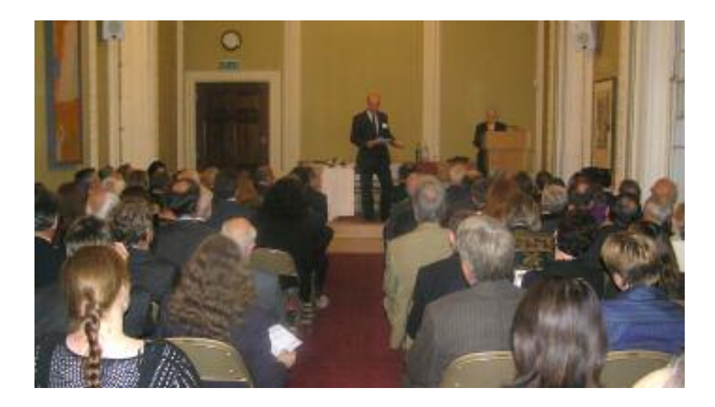
Figure 4: Newly elected Fellows of the British Academy are welcomed to the Academy, September 2008

Partly because the idea was too mindstretching; partly because it is always difficult, in a large organisation, to prove that a directing mind ( mens rea ) was behind a piece of criminal negligence. Not until the Corporate Manslaughter and Corporate Homicide Act 2007 – a fortyyear-late response to Aberfan and other disasters – has that gap been filled.