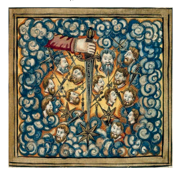
Figure 5. A portent of bloody heads in the clouds with a sword, which would announce bloody battles in times of Civil War.