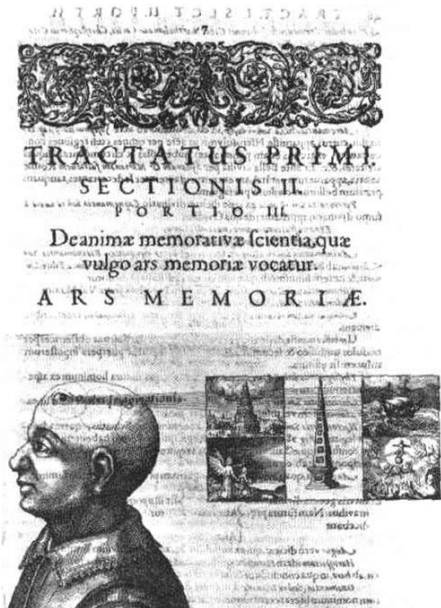
Figure 1. Robert Fludd's images of the mind's eye.