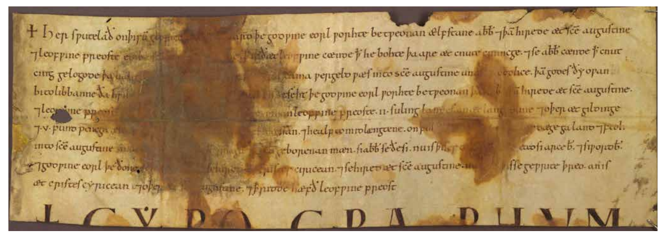
Figure 3 Old English record of a dispute between Abbot Ælfstan of St Augustine's and the priest Leofwine concerning 'St Mildryth's property'; and of its settlement when St Augustine's granted Leofwine property at Landon and Ileden (Kent) and an annual payment of £5 [A.D. 1044 × 5] (Canterbury D and C, Chart. Ant A 207 c 100 × 305 mm)

We are indeed fortunate that the cathedral kept this manuscript, for one of the 12th-century archivists who worked through the entire collection of pre-Conquest documents at Christ Church, endorsed this one as 'Inutile' ('useless'), probably intending it to be binned.