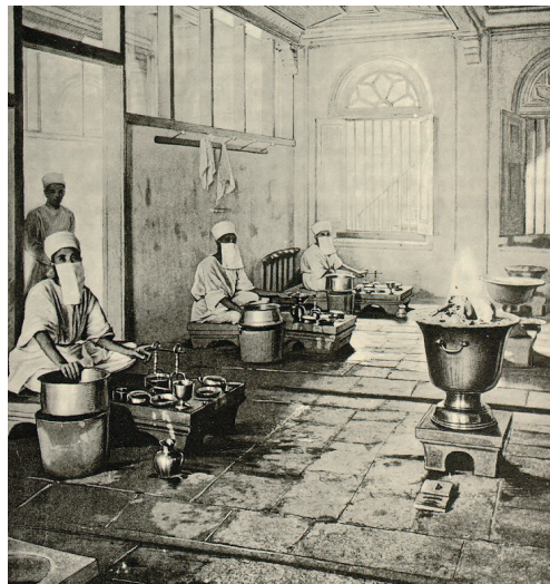
Priests performing the Yasna ceremony at the Fire Temple Maneckji Seth. From: Darmesteter, Zend-Avesta vol. 1.

accounts, very little is known about how Zoroastrian priests are trained, as no investigation of their teaching and learning techniques has ever been undertaken. Such a study is likewise urgently needed as this tradition too is endangered. The Multimedia Yasna project will document and investigate the training of cultic personnel in Zoroastrian priestly schools and homes in India and Iran. This part of the project entails further filming in order to capture the teaching and learning techniques of the trainee priests rehearsing the Yasna ritual and memorising the text, and will show how a millennia-old tradition is carried on. ■