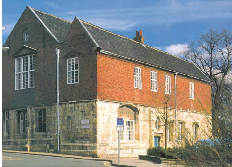
The Borthwick Institute at St Anthony's Hall (1953–2005)