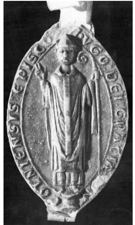
The seal of St Hugh of Avalon, bishop of Lincoln