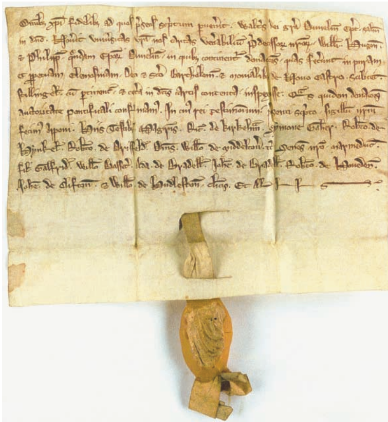
An agreement between Richard of Ilchester, bishop of Winchester, and the master of Hospitallers, dated 1185

follow that such texts are critical to our understanding of the origins of those most fundamental institutions of the English medieval church, the monastic houses and the parishes. Not surprisingly, given the landed wealth needed to sustain the former, bitter conflicts for property and prestige led to the widespread habit of forgery, a problem which still bedevils the interpretation of so many charters issued by bishops during the two centuries after the Norman Conquest. Medieval forgery is more complex than it might seem; and an astonishing number of major monasteries in England (and some very minor ones) were involved in a practice which presents modern scholars with the problem of where documentary 'truth' really lies.