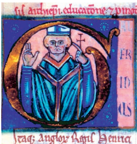
Illuminated initial letter from the Vita Galfridi, possibly intended to represent Geoffrey Plantagenet, archbishop of York.

Like most important research projects, the episcopal acta series has an exhilarating tendency to raise even more significant questions than those it answers. Certain familiar problems, like the identity of the personnel who served in episcopal households, have never been so well documented as they now are by successive Acta volumes. On the other hand, it can still remain extremely difficult to know how far (in Sir James Holt's formulation of the problem) 'the surviving documents represent the administrative activities from which they spring'. That said, the Acta project leaves no serious doubt of the increasing authority of the English bishops over their dioceses during the reigns of the Norman, Angevin and early Plantagenet monarchs. Throughout this long period the great majority of surviving episcopal charters always tended to be concerned with parish churches and monasteries. Thus of the 150 surviving acta from the diocese of York between 1070 and 1154, approximately half are confirmations of grants of churches and privileges made to religious communities. It can hardly fail to