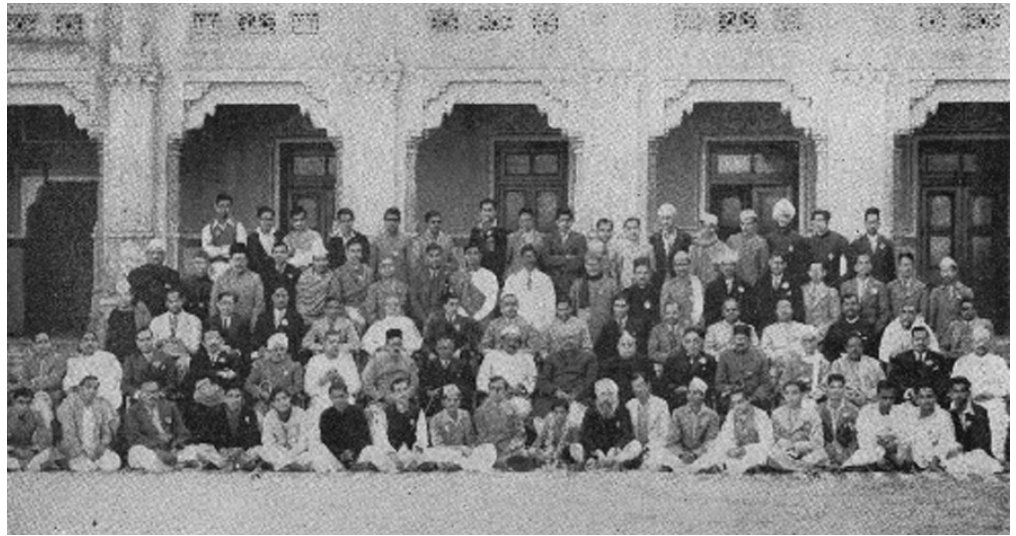
The first Indian Political Science Conference, held at Benares Hindu University, on 22–24 December 1938.

Equally important are the forms of knowledge that were generated in these exchanges. Anti-imperial and anti-colonial projects produced new ways of thinking about the purpose of social science. Often this resulted in a more emancipatory vision, one that often questioned the presumptions of race and hierarchy that were embedded within notions of ‘great powers’ and their authority to rule. This attitude also led to a questioning of the centrality of European histories. Long before the